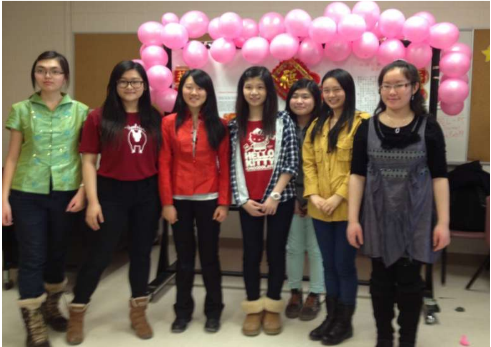
The student organizers from the International Student Association