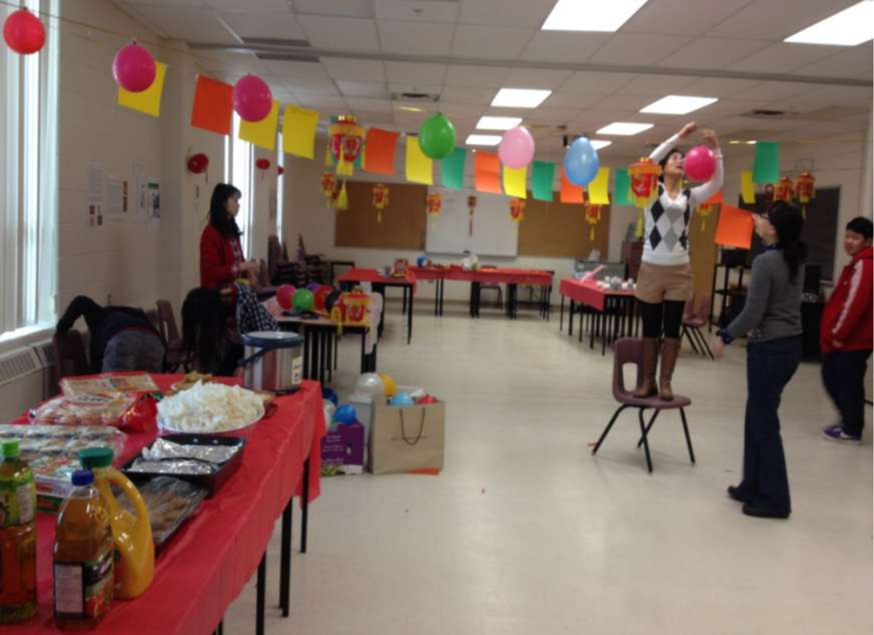
Organizers decorated the classroom in advance of the party.